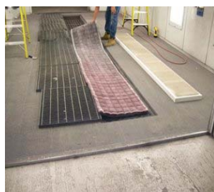
Booth Floor With Dirty Filters

The efficiency of the spray booth operation, as well as the resulting quality of the sprayed finish is affected by both the intake and exhaust filters (also known as paint overspray arrestors). When the intake and paint arrestor filters are well maintained, the air flows evenly through the spray chamber and around the part or vehicle surface, picking up the overspray and volatiles and promptly removing them from the area.