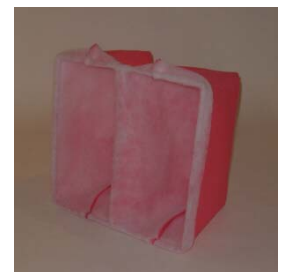
Pocket Cube Filter