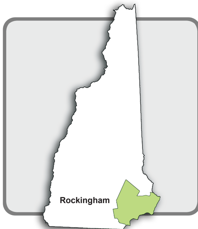
Table 1. Breakdown of monitored and unmonitored coastal beaches by county for 2009.