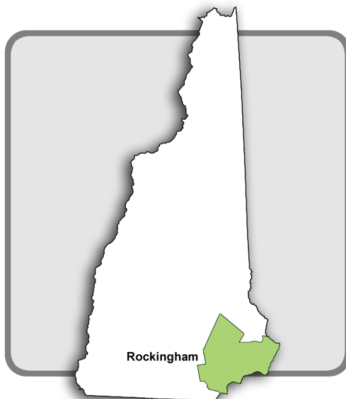
Table 1. Breakdown of monitored and unmonitored coastal beaches by county for 2010.