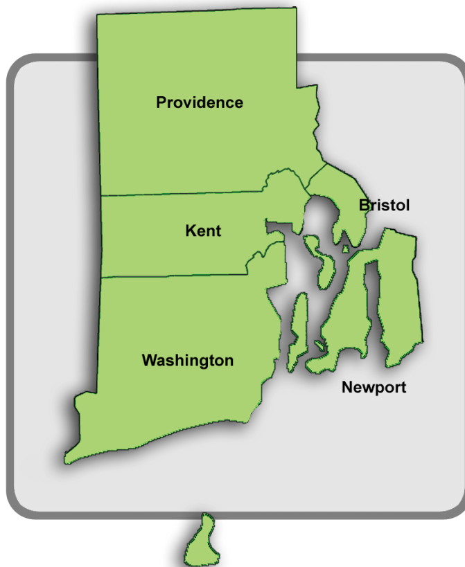
Table 1. Breakdown of monitored and unmonitored coastal beaches by county for 2010.