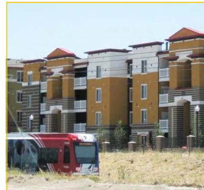
Lions Gate Development, Utah

On page 3 of the link (click headline above), read about the first phase of the Lions Gate Development in Murray, Utah; check out the Arizona Department of Environmental Quality's Brownfields Program's assistance to the town of Parker with asbestos abatement for a town hall, police station and public library; and learn about a proactive approach to land acquisition by the Confederated Tribes of the Colville Reservation.