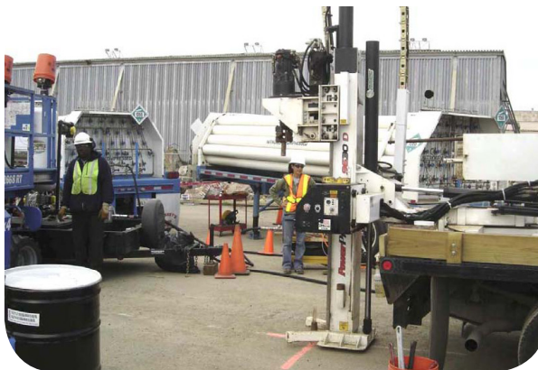
Pneumatic fracturing at the Hunters Point Naval Shipyard Superfund site

Fracturing is used to help reach contaminants in rock and dense soil so that they can be cleaned up faster and more completely. It offers a way of reaching contamination deep in the ground where it would be difficult or costly to excavate. Fracturing can reduce the number of wells needed for certain cleanup methods, which can save time and reduce cleanup costs.