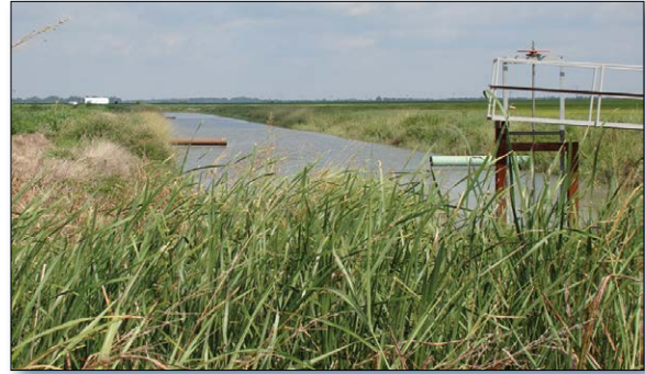
Figure 3. Landowners installed drop pipes that discharge runoff water directly into a waterbody to avoid erosion.

In 2010 the Poinsett County Conservation District (PCCD) followed CCCD's lead and began providing financial and technical assistance to landowners to help implement water control structure BMPs. The PCCD implementation project, also supported by CWA section 319 funds from the ANRC, resulted in the addition of 287 water control structures on 63 different farms.