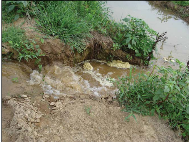
Figure 2. Erosion during agricultural runoff contributed sediment to the St. Francis River.