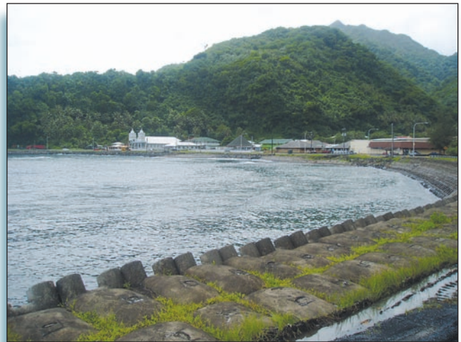
Matu'u waterfront, the site of Afuelo Stream in American Samoa.

Pigs are an important cultural resource in American Samoa. There are approximately 35,000 pigs on 2,700 pig farms on Tutuila alone, mostly in private backyards. Local small-scale pig farms (1-20 pigs) commonly consist of makeshift open-sided buildings placed on concrete slabs or packed earth floors. Farmers typically clean out these facilities by flushing the floor with pressurized water, which is then discharged as waste/water slurry into an unlined cesspool or directly into streams or wetlands. There has been a lack of community and political will to support proper pig waste management, and the impacts of pig waste on human health and water quality are now critical. Large volumes of untreated and uncontrolled pig urine and feces contaminate drinking water, streams, and nearshore ocean water in 31 of the 41 watersheds in American Samoa.