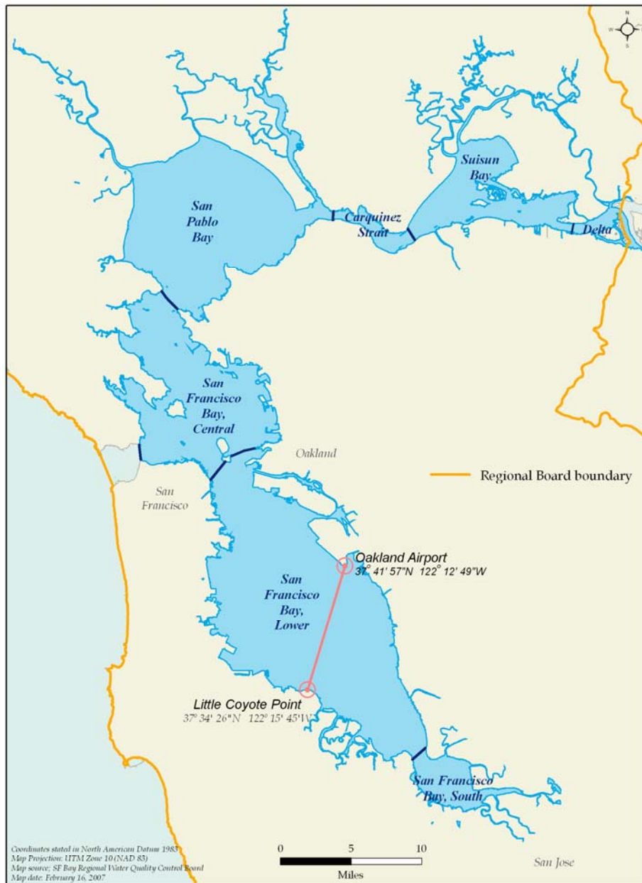
Figure 7.1 Segments of San Francisco Bay showing location of Hayward Shoals as a line connecting Little Coyote Point and the Oakland Airport.