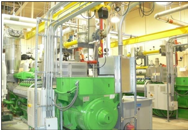
Internal Combustion Engine CHP System at Bergen County Utility Authority, Little Ferry, New Jersey