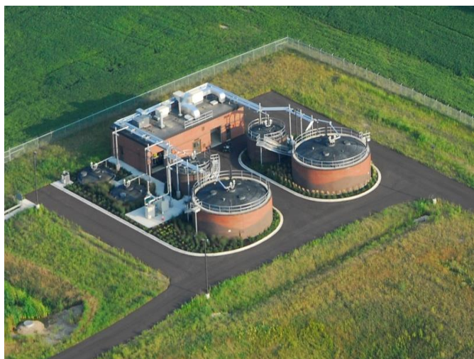
Aerial view of the Delhi Charter Township IBES System

Prior to the digester upgrade and CHP system installation, the plant flared the biogas produced in its digesters. The IBES system allows the plant to capture and use the biogas produced in its