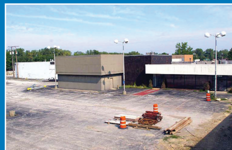
Former auto dealership in Berea, OH, acquired by CCLRC with NSP funding

property taxes and assessments that are not paid when due. CCLRC also generates revenue through the resale of acquired properties and through grants from foundations and government programs. CCLRC and its partners received nearly $41 million in NSP funds to demolish blighted homes and renovate others in 20 county neighborhoods. CCLRC also received a $400,000 EPA grant to assess contaminated sites for environmental risks and potential redevelopment.