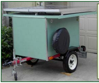
Portable electricity generators equipped with photovoltaic panels and batteries can be used to power investigative equipment such as chilling or heating units.

Procurement of goods and services offers other opportunities for conserving natural resources: