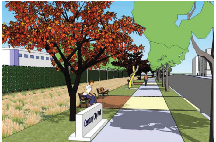
Perspective view of linear park with industrial buildings in the background.

For example, one of the area-wide plans, for the Century City area of the 30 th Street Industrial Corridor, envisions a green, linear park that will buffer the new industrial redevelopment planned for the area from an adjacent residential area. The long greenway will