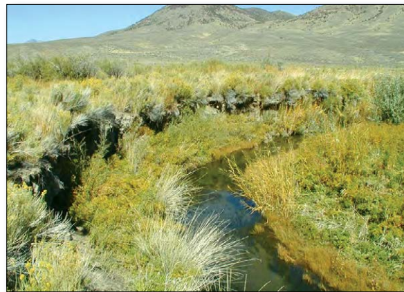
Figure 1. Idaho's Raft River is in the Snake River watershed.

To confirm impairment and determine background levels of bacteria (and other pollutants), DEQ and the Idaho Association of Soil Conservation Districts (IASCD) collected water quality data along the Raft River from 1999 through 2002. Idaho's secondary contact recreation water quality standard