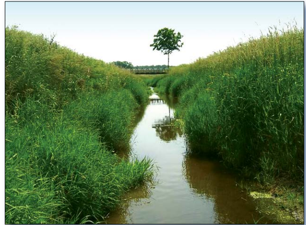
Figure 2. Buck Creek in the summer of 2011, after extensive BMP implementation.

Since 1990 IDEM has directed $900,747 in CWA section 319 funds and $53,997 in CWA section 205(j) funds, as well as $543,300 in local in-kind