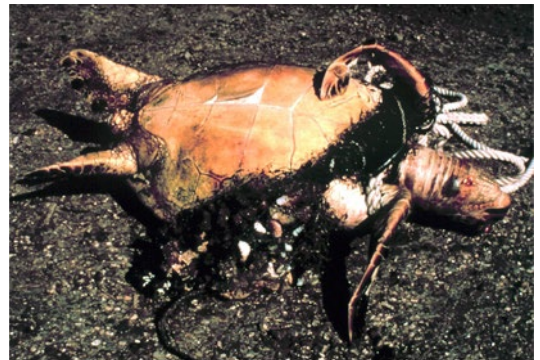
Several marine mammal, sea turtle, and bird species are in danger of extinction in large part from entanglements in fishing gear and other debris. This turtle was killed by boat debris.

If you've ever accidentally splashed a little gasoline on your hands when filling a car tank, you know that gas smell is pretty powerful and sticks around a long time. In fact, as little as one quart of oil or gasoline can contaminate up to 250,000 gallons of water. So here we have a dilemma—motors on powerboats need oil and