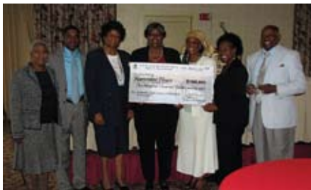
Harambee House, Inc.

In order to increase community involvement in their CARE project, Harambee House, a community-based organization focused on environmental justice and community development, has used several techniques to attract community members to CARE meetings. Providing free food and childcare were crucial in getting community members to attend initial meetings, but they also did something to ensure the long-term involvement of residents—they targeted youth for involvement. Toward this end, Harambee House held a community retreat to encourage community members of all ages to participate in a charrette.