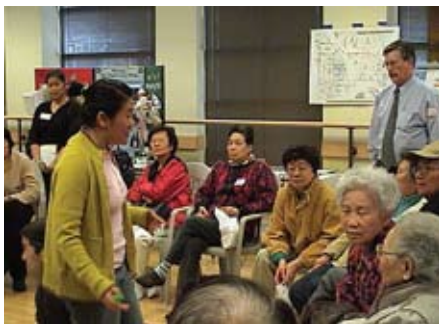
The International District Housing Alliance (IDHA)

so IDHA could provide them with the reinforcement to stick with the project. Partnering with a local university, the collaborative used students to convene focus groups and surveys to obtain partner feedback and evaluate the strength of partnerships. These tactics helped IDHA solidify current partnerships and increased the number of partnering organizations from nineteen to 30 by the end of their Level I grant.