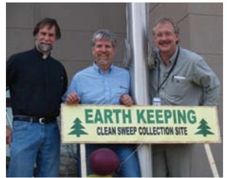
Earth Keepers Initiative

Pacoima Beautiful decided that one way to build long-term community capacity to continue improving the local environment was to produce several documents which would promote further discussions of toxic risk. They updated an Environmental Health Initiative Report to highlight recent activities and successes. A second document developed under the partnership was a Risk Data Report, a compilation of data on toxic risks in the community. These documents and others were distributed to partners and community members to show the importance of addressing toxic risk and demonstrate that the community still faces many issues. Pacoima Beautiful also developed resident workshop and tour curriculum packages to distribute to participating residents and students. These consist of lesson plans, maps, data and research, and art activities focused on the environmental issues in Los Angeles.