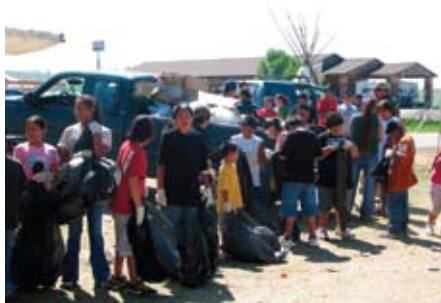
Montana Indian Country

used the Promotora (a community outreach worker) model to reach community members and gain valuable insight into environment and health related data. Their Promotora is an elderly woman who grew up in the community and is respected by Tribal members. She was trained by the project to go door-to-door in the community to conduct a healthy homes inspection, survey residents on their asthma conditions, and provide educational materials on asthma. She is able to communicate better with community members and elicit information that other sources could not provide. The data she collected will help identify the causes for asthma conditions in the community.