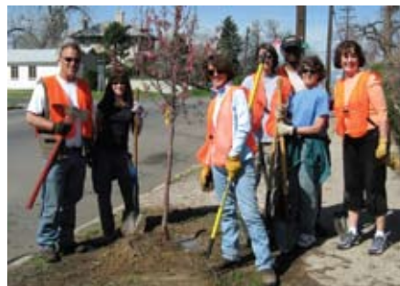
HAND (Healthy Air for Northeast Denver)

CARE Grant: Level II Location: Denver, Colorado Community Served: Urban, low-income