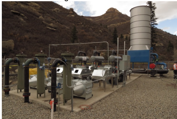
Combustor and one of three 1-MWe power generators being placed at Elk Creek mine

This project drains methane from sealed areas of the mine—through an underground drainage system—to reduce emissions into working areas of the mine. Surface equipment then utilizes the methane for 3-megawatt electricity (MWe) power generation with excess gas combusted.