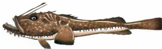
Monkfish ( Iophus americanus )

NOAA Fisheries, in coordination with the New England and Mid-Atlantic Fishery Management Councils, announced the selection of two cooperative research proposals submitted to the 2016/2017 Monkfish Research Set Aside (RSA) Program. Researchers will work on two projects involving dozens of commercial fishing vessels, supported by awards valued at approximately $3.77 million. Both grant recipients propose to build on previous research in an effort to identify monkfish stock structure through genetic studies and to estimate growth and movement of juvenile monkfish.