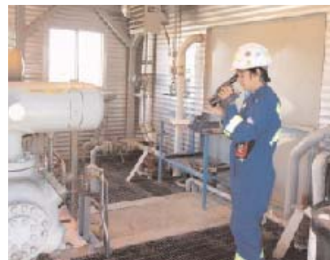
A ConocoPhillips Canada staff member using infrared video camera.

To view Ms. Pettipas' full presentation, in addition to other presentations from the 2007 Natural Gas STAR Annual Implementation Workshop, please visit epa.gov/gasstar/workshops/14th_agenda.html .