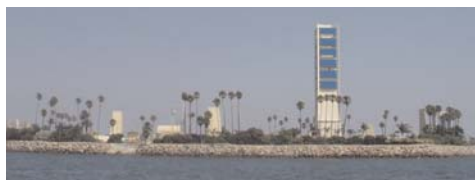
THUMS Artificial Island.

which is the first commercial application of this technology. Prior to installing the technology in 2002 at this site, the poor-quality associated gas was flared, which wasted the hydrocarbons (including methane). Tidelands implemented a solution using Engelhard's novel fixed-bed adsorption medium, which accomplishes three gas-treatment processes in one unit: removing water, acid gases (primarily carbon dioxide), and heavier hydrocarbons. The resulting 0.5 MMcf per day of recovered gas is sold to a local utility. The tail gas from the unit is used to fuel several 2000 bhp Waukesha, 16-cylinder internal combustion engines to drive water injection pumps. This substantially reduces Tidelands' electricity demand for these pumps, returning produced water back to the crude oil reservoirs.