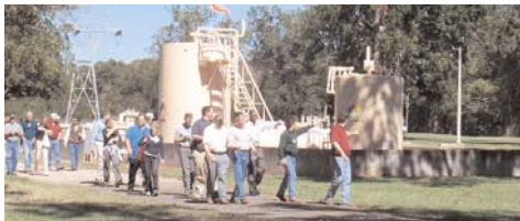
Kinder Morgan's Midcon Texas Pipeline Corporation Sugarland Compression Station.