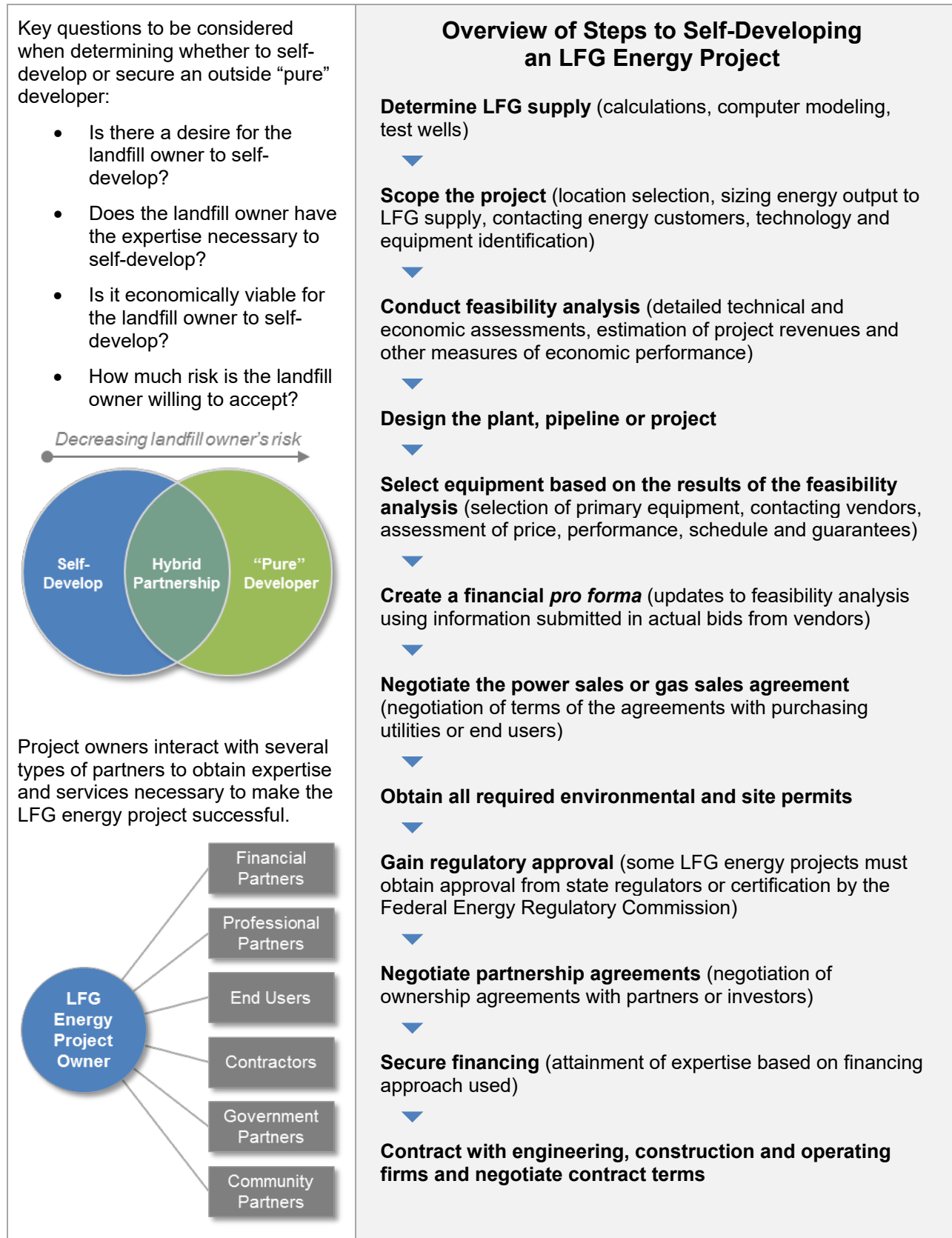
Figure 6-1. Considerations for Selecting the Project Development Approach