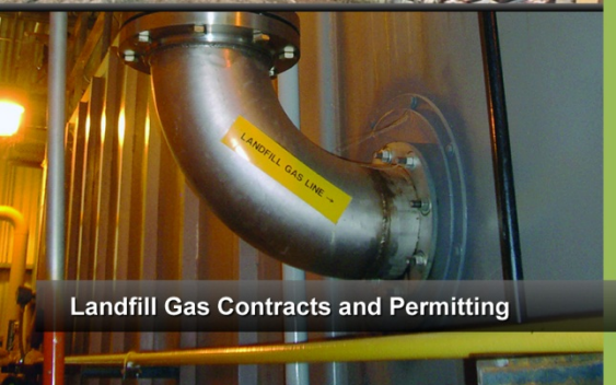
Landfill Gas Contracts and Permitting