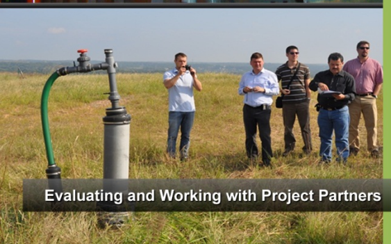
Evaluating and Working with Project Partners