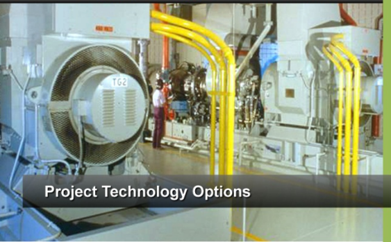
Project Technology Options