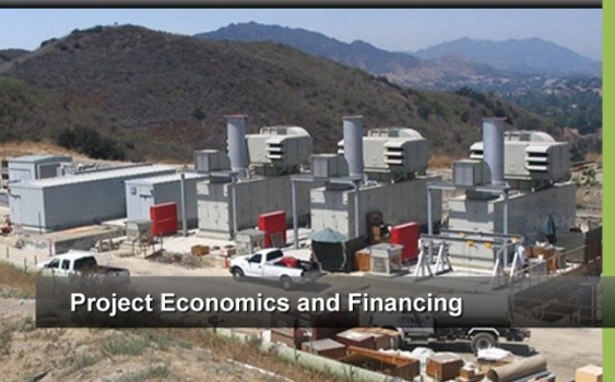
Project Economics and Financing